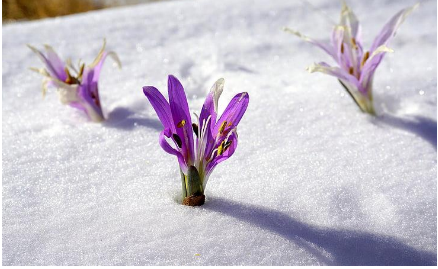
Purple Flowers in Snow (royalty free image)

Every good and perfect gift is from above, coming down from the Father of the heavenly lights, who does not change like shifting shadows. --James 1:17