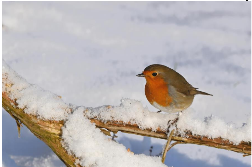
European Robin in Snow

The messenger of the covenant in whom you delight—indeed, he is coming, says the Lord of hosts. --Malachi 3:2