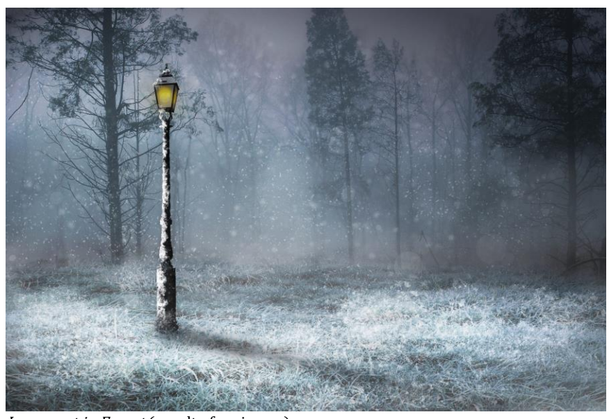
Lamppost in Forest (royalty free image)

The light shines in the darkness, and the darkness did not overcome it. --John 1: 5