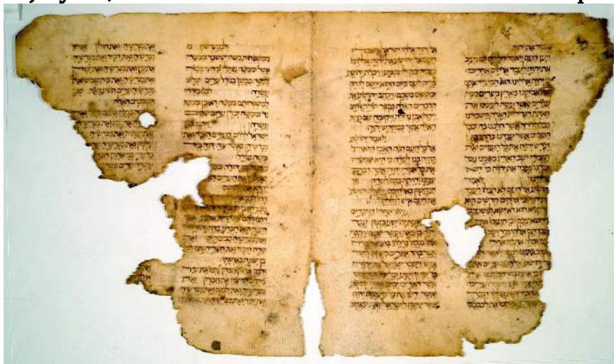
Hebrew Manuscript, Joshua 20

“Therefore we also will serve the Lord, for he is our God.”