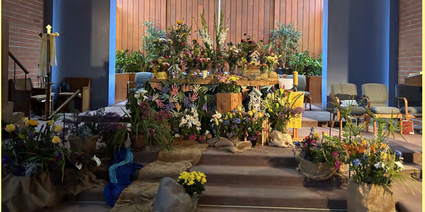
Easter Garden 2024