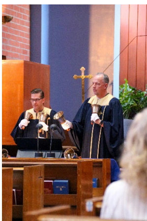
Bell choir members