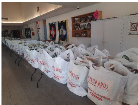
Bags for Food Ministry.

Our relationships with the community at large also continue with Oak Tree D Street on our campus, along with Key Essentials to Behavior Management . The Straight Up AA group meets here every Saturday, as does the Symphonie Jeunesse Orchestra . Our relationship with San Bernardino High School has blossomed as the Lifeskillz group and our Internship program continue to benefit both the students and our church.