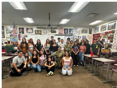
LifeSkillz students and leaders

In 2026, we want to continue and grow all of this, and explore new ways of learning.