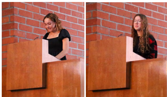
Photos from Youth Sunday 2025

Please check the calendar on the website for the most up-to-date information for June (calendar next page) and for the month of July.