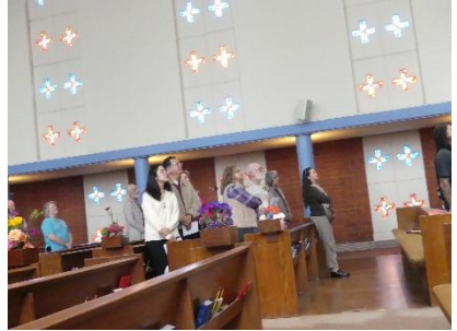
Listening to the Halleluiah chorus