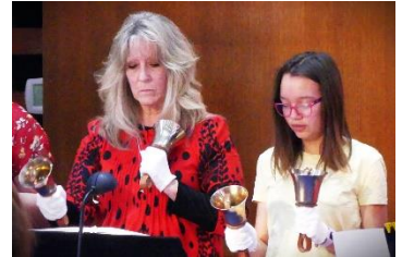
Bell choir members