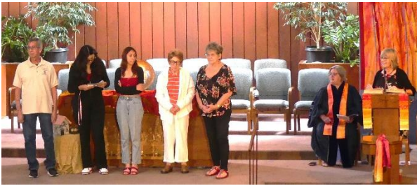
Lifeskillz leaders on Trinity Sunday.

We also strive to create and maintain relationships with the community at large. In this tradition, we welcome Oak Tree D Street to our campus, along with Key Essentials to Behavior Management . The Straight Up AA group meets here every Saturday, as does the Symphonie Jeunesse Orchestra . Our relationship with San Bernardino High School has blossomed as the Lifeskillz group and our Internship program continue to benefit both the students and our church.