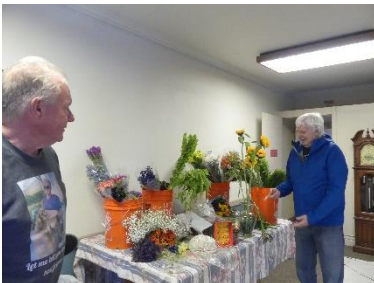
Preparing for Easter Sunday.

We know how to celebrate our love of God and God's world here at First Pres. Remember candlelight Christmas Eve services, glorious Easter Sundays full of flowers from the congregation, and joyous Reformation Sundays with bagpipers, drummers, and shortbread. Remember the quiet peace of a healing service, the feel of the oil on your forehead as you are