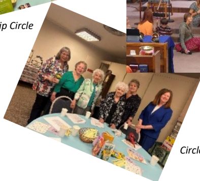
Circle of Hope & Grace