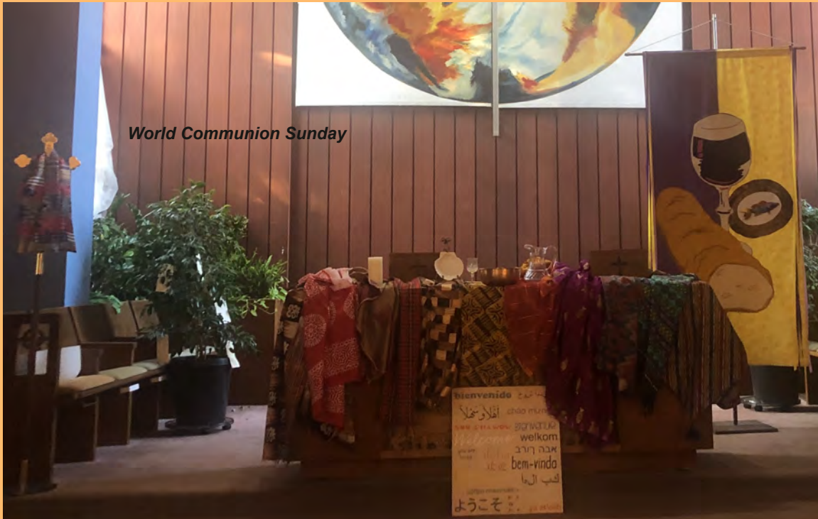
World Communion Sunday