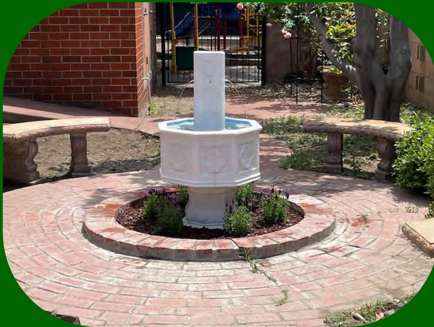
James has been working on renewing the Meditation Garden outside the Chapel. This is a photo of the refurbished fountain.