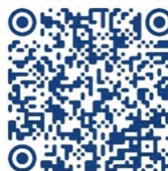
MAP QR Code

https://fpcsb.net/wp-content/uploads/2024/04/Mission-Action-Plan-final.pdf