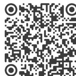
MAP QR Code

We invite you to read the new Vision & Mission Statement contemplatively.