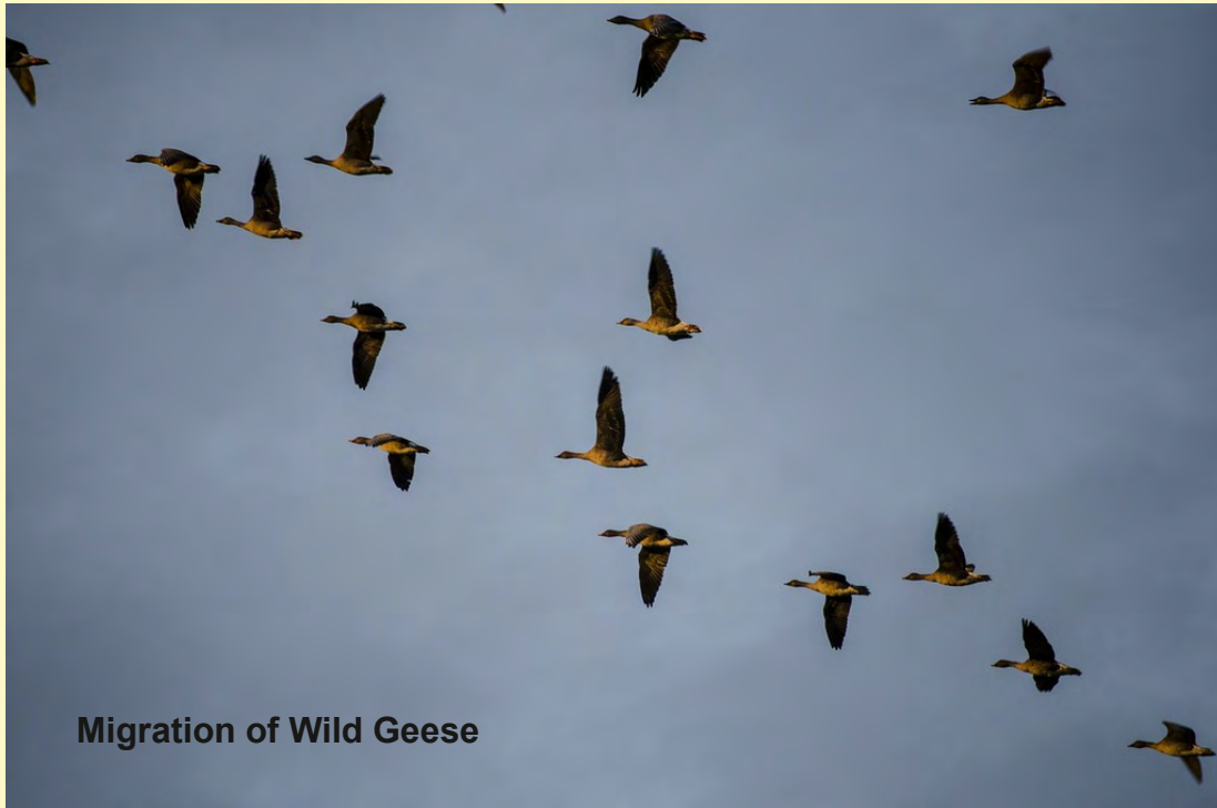
Migration of Wild Geese