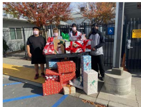
Volunteers receive the gifts at CCLM.

P.S. Don't forget to pick up some goodies at the P.W. Super Bowl Bake Sale on Feb. 11. following Worship.