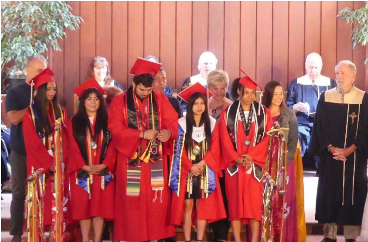
LifeSkillz leaders and graduates

In 2024, we want to continue all of this, as well as exploring new programs and ways of learning.