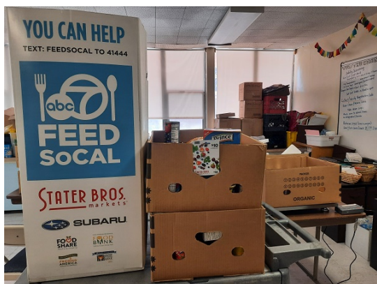
July food drive donation from Subaru

In May, we were assigned a retail partner, Northgate Gonzales Market on Sierra Ave in Fontana. The market needed some time to get their donation system set up and we were told to expect to start receiving donations in the Fall. As part of being a retail partner, FARSB provided us with a scale and a thermal blanket to make sure we were equipped. This also allows us to directly pick up donations from local organizations that hold food drives. So we've done that twice.