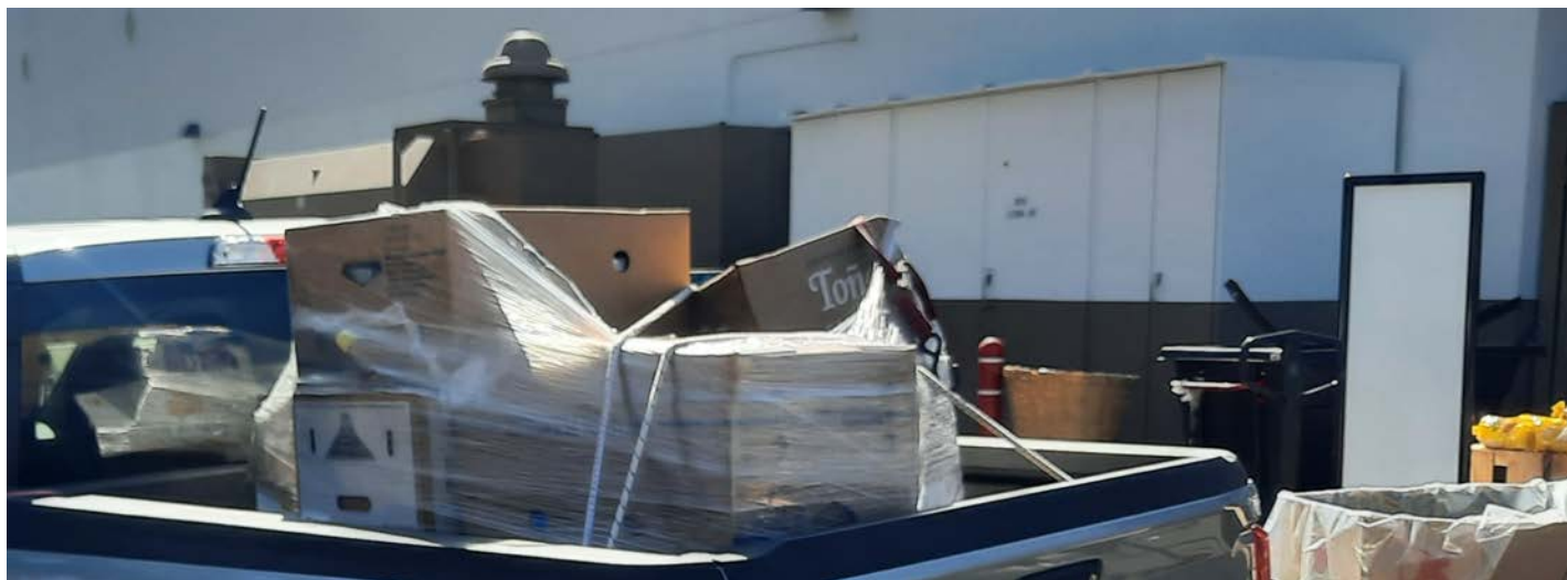
Donations from Northgate Market

At the end of August, we picked up our first Northgate donation, and we now go weekly on Fridays. Normally, the food we get from FARSB comes at a cost of 19 cents per pound (a maintenance fee). When we pick up food directly, whether from our retail partner or from a food drive, we report the weight to FARSB, but we do not pay a per pound fee. In our first month, we've received about 1200 lbs of food from Northgate Market, adding to our bags beans, menudo, chipotle sauce, hominy, and canned peppers, among other culturally appropriate foods.