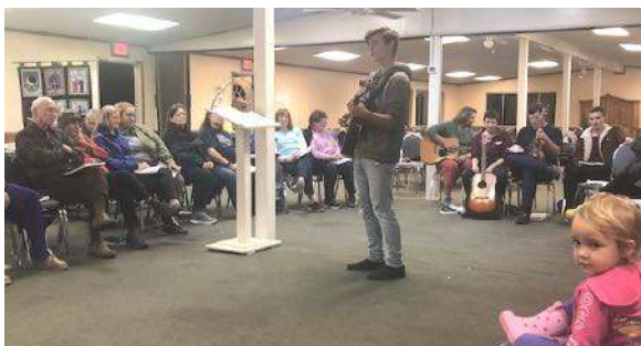
"Indoor Campfire" Photo from All Church Family Camp 2019

O God you are good, your love endures forever, your faithfulness to all generations! Psalm 100:5