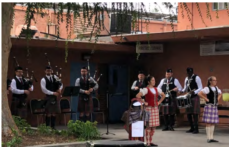
Last year we celebrated Reformation Sunday outside with pipes, drums, and dancing. Come celebrate Reformation Sunday on October 30.